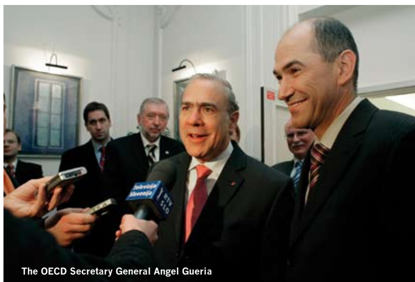
The OECD Secretary General Angel Gueria

The OECD Secretary General Angel Gueria praising the outcome said "The Accra Agenda for Action represents a significant step forward and presents donors and partners with a series of new concrete measures to accelerate movement towards agreed development goals. It is the blueprint to make sure that we meet our commitments under the Paris Declaration