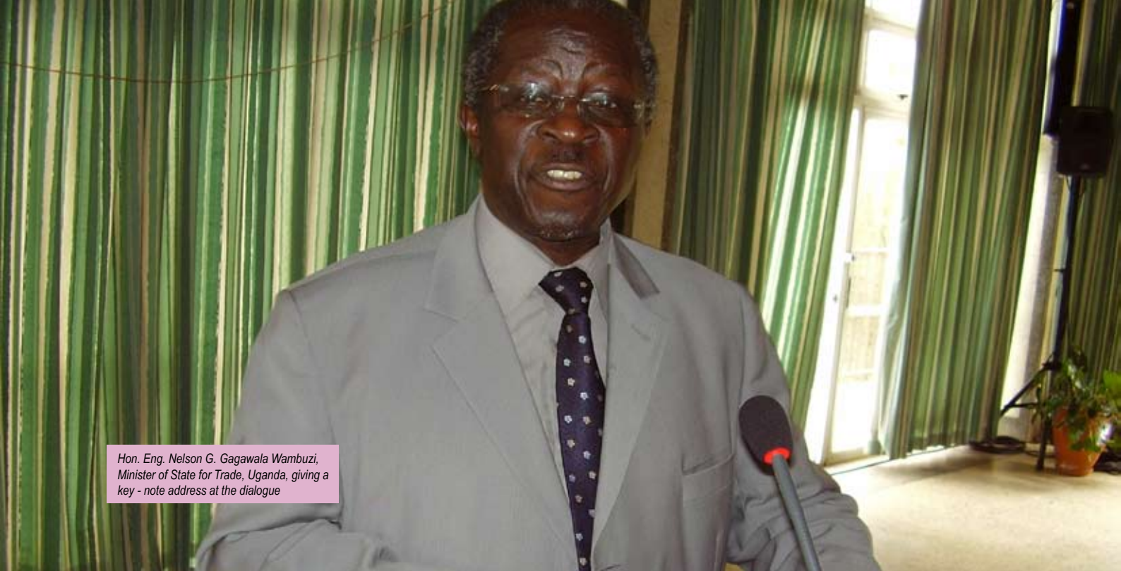
Hon. Eng. Nelson G. Gagawala Wambuzi, Minister of State for Trade, Uganda, giving a key - note address at the dialogue