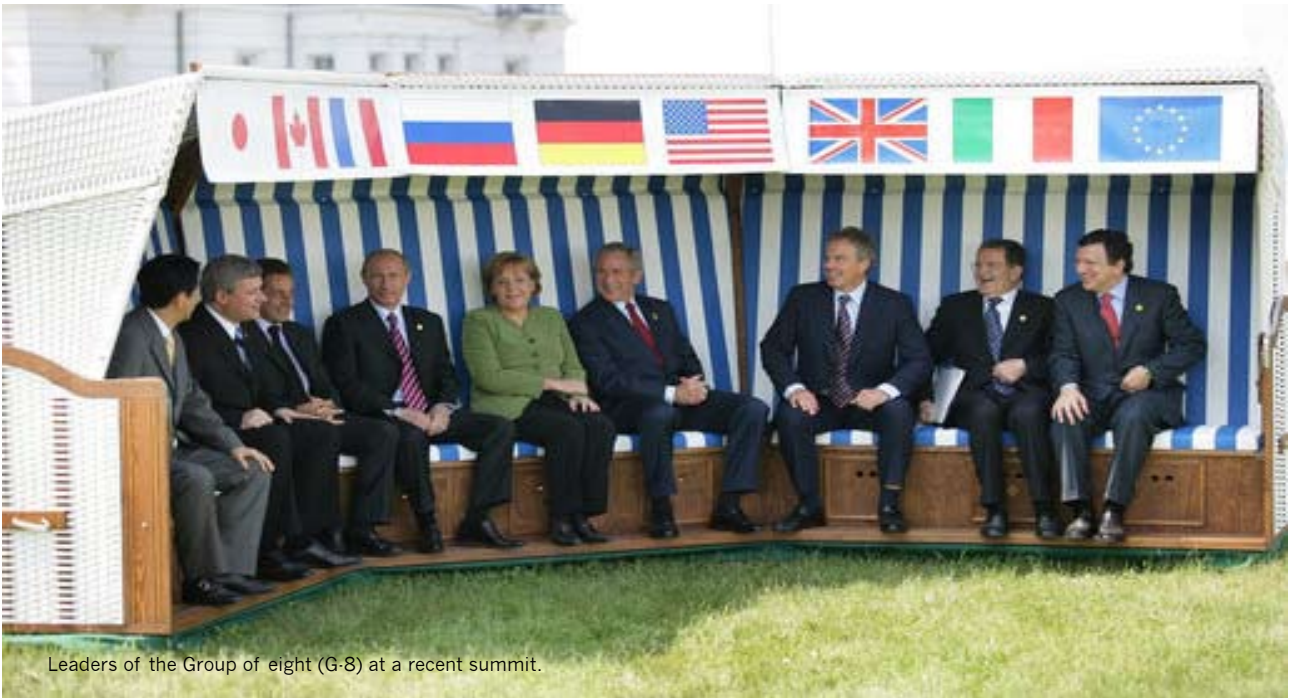
Leaders of the Group of eight (G-8) at a recent summit.